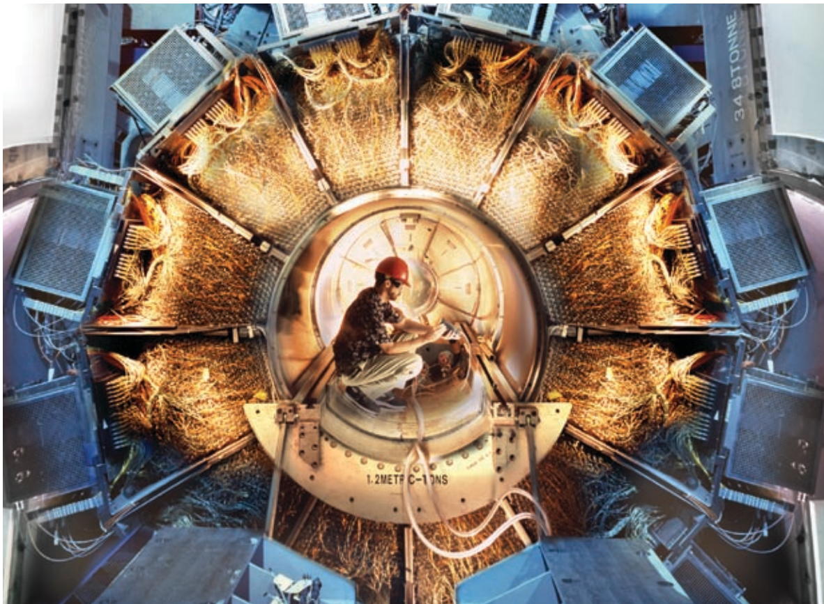
FIGURE 2 The BABAR detector at Stanford Linear Accelerator Center

A key ingredient to this program is determining accurately the angles of the Unitarity Triangle based on the study of CP violation in B decays. Specifically, the angles are related to the amplitude of the so-called time-dependent CP asymmetry, defined as the asymmetry between the decay rates of the neutral B and anti- B meson to the same final state.